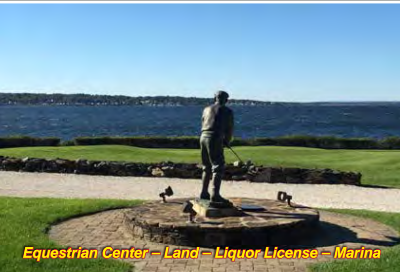
Equestrian Center – Land – Liquor License – Marina

Portsmouth, RI ~ Newport County Leasehold & Fee Interests in “The Carnegie Abbey Club” Tues., December 4 at 2pm On-site