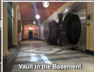
Vault in the Basement