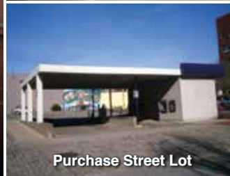
Purchase Street Lot

Built at the corner of Purchase St. in 1915 for Merchants National Bank. This high-profile period gem was previously used as a bank, restaurant & multi-tenant office space. But, the property is suited for a wide variety of potential uses under Mixed Use Business zoning.