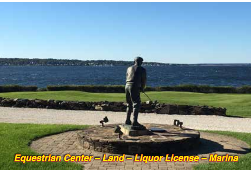
Equestrian Center – Land – Liquor License – Marina