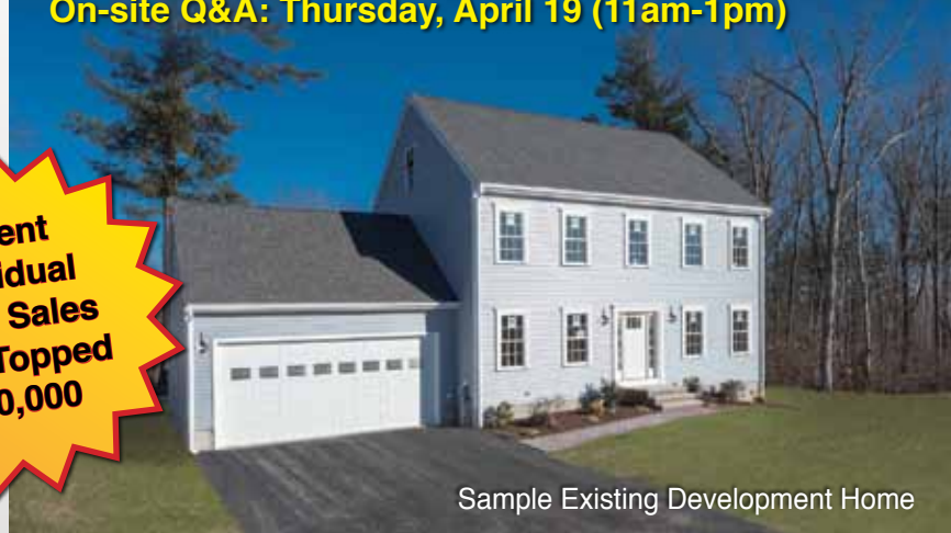
Sample Existing Development Home

Recent Individual Home Sales Have Topped $500,000